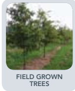
FIELD GROWN TREES